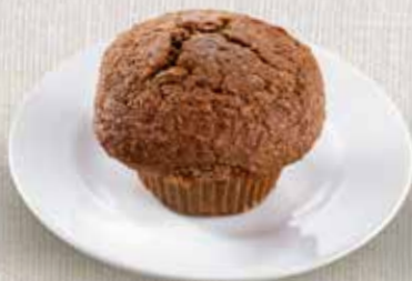
Carrot Muffin 08018