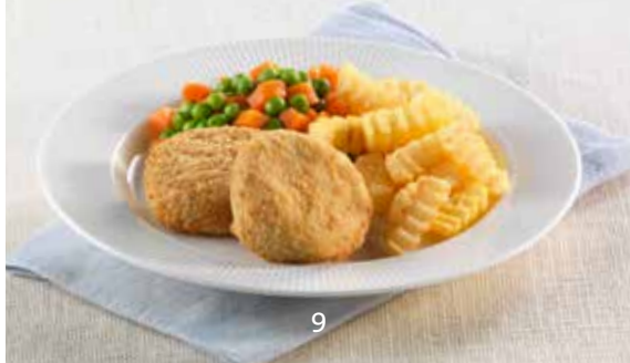
Fish Cakes 12134

Haddock with a creamy herb sauce served with red-skinned potatoes and mixed carrots and green beans. 285g GF LC LF LS