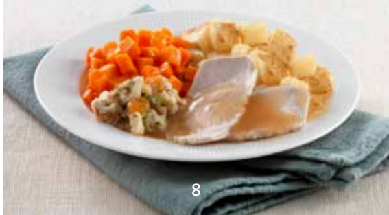
Pork with Suffing 12020

With red-skinned potatoes and carrots. 300g LC