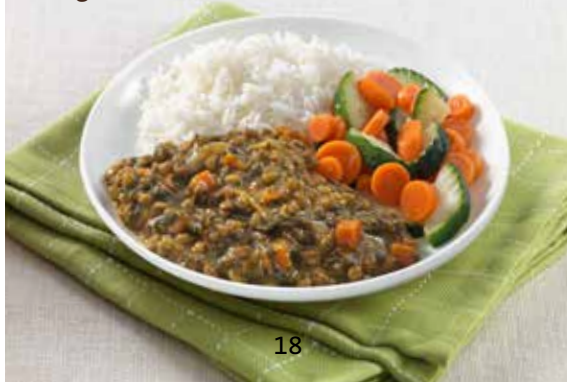
Vegetarian Dhal 10063

Haddock with a creamy herb sauce, served with red-skinned potatoes and mixed carrots and green beans. 285g GFLC LF LS