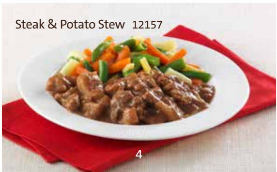
Steak & Potato Stew 12157

With country-style potatoes, carrots and green and yellow beans. 286g GF LC LF