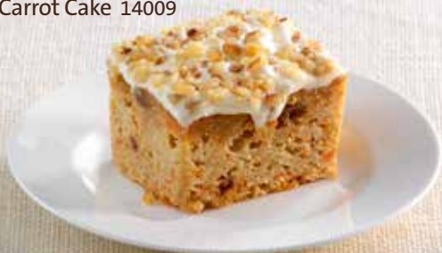
Carrot Cake 14009