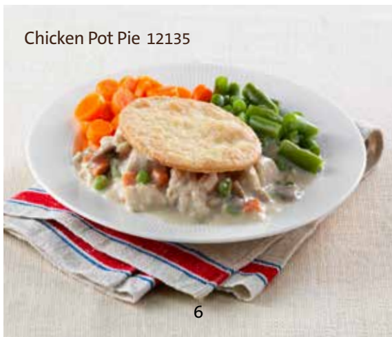
Chicken Pot Pie 12135

Chicken and vegetables in a cream sauce topped with pastry served with green beans and carrots. 355g LC